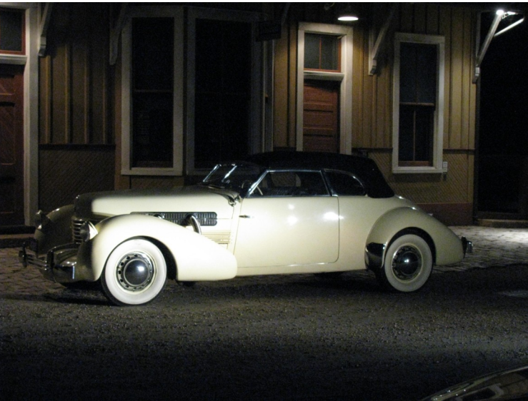
Antique car in front of the Station House during Candlelight Tours

We had many, many visitors that came for the Candlelight Tours, including the Central Virginia Antique Auto Club. We hope to continue to make our Cemetery appealing and inviting, both with the versatility of our programs and with the continued beautification of the site. We hope to bring much more of both to all of you in 2012!