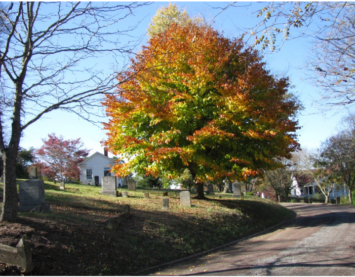
This beautiful beech is located in the Taylor Street curve