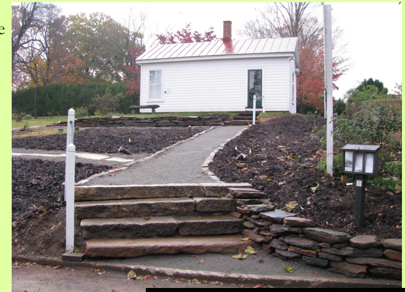
New Pest House Garden and Walkway